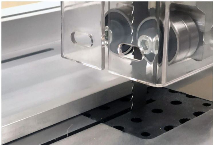
Professional easy blade guides the heavy blade guide is rack and pinion adjusted for height and is supported by a large 30x30mm solid steel bar giving accurate blade control. The guide block uses 5 replaceable bearings in a proven solid guide block. The table insert is perforated to improve the dust extraction efficiency